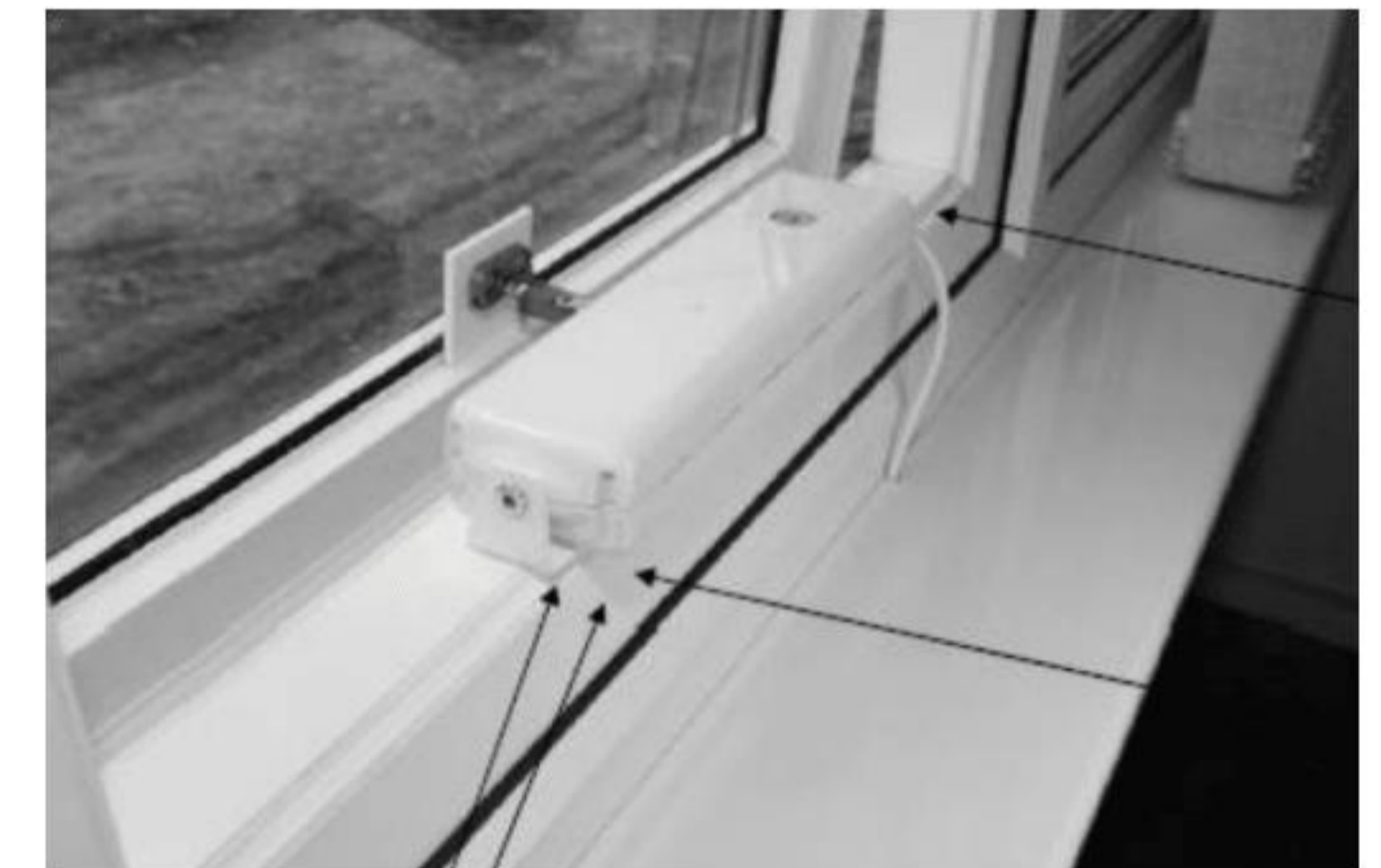
Roof vent shown fitted vertically for test purposes

TOPPs ACK chain motor fitted to a thermally broken aluminium roof vent.