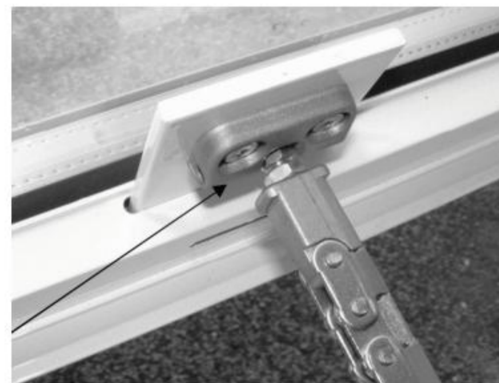
(fig 2. Adjustable chain-end)

You must adjust the threaded end of the chain so that the motor switches off at the same time as the window reaches its closed position (see fig 2. Adjustable chain-end )