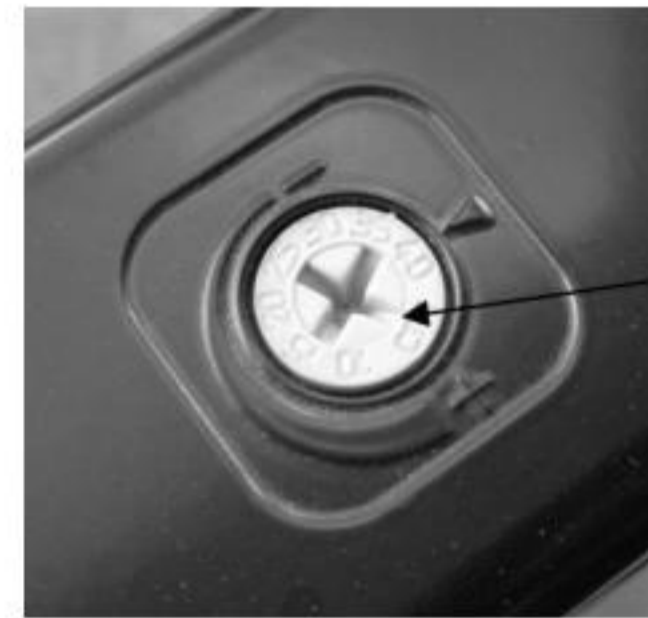
(fig 1. Adjustable dial)

Do not automatically set the dial to 40cm, a shorter chain extension may be preferable